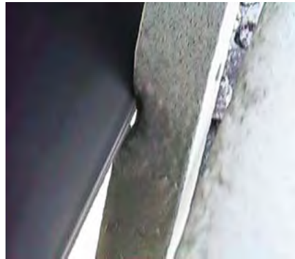
Structure on the return side of the conveyor is often the first area damaged.

Misalignment occurs on all conveyors. Although a certain amount can be corrected through proper maintenance and mechanical training devices, there will always be outside forces which will cause the belt to run outside the acceptable operational limits. The variable is the amount of misalignment that can be allowed before action must be taken. Due to belt tension and structural limits, misalignment detectors should be installed at both the head and tail of all conveyors.